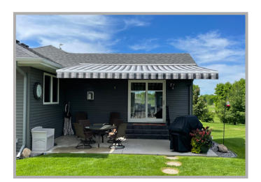
High pitch with even front bar

You can adjust the angle of the Elevation unit to meet your changing needs. With a turn of the pitch adjustment crank, you can change the front angle of the unit. You can also raise or lower the front bar by adjusting all shoulders.