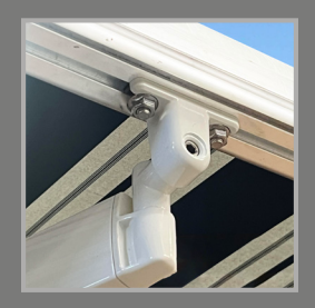
The unique articulating arm wrist allows for maximum unit movement to help prevent wind damage