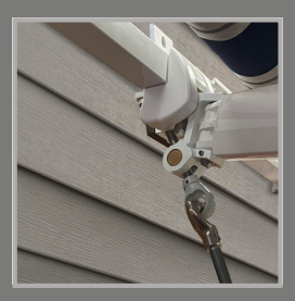
Adjustment pitch shoulders, for greater sun control and use in light rain conditions