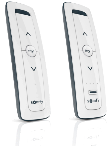
Also available in these attractive colors