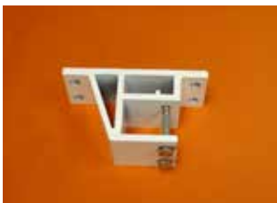
Summit Install Bracket

The Summit components meet stringent ISO 9001 and TUV standards and are assembled in the USA by skilled craftspeople.